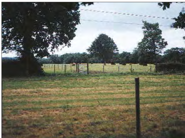
• Cattle at Kendal Hall Farm