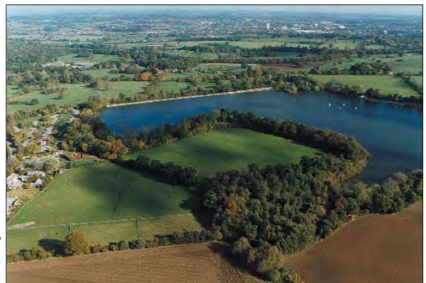
Aldenham Country Park •