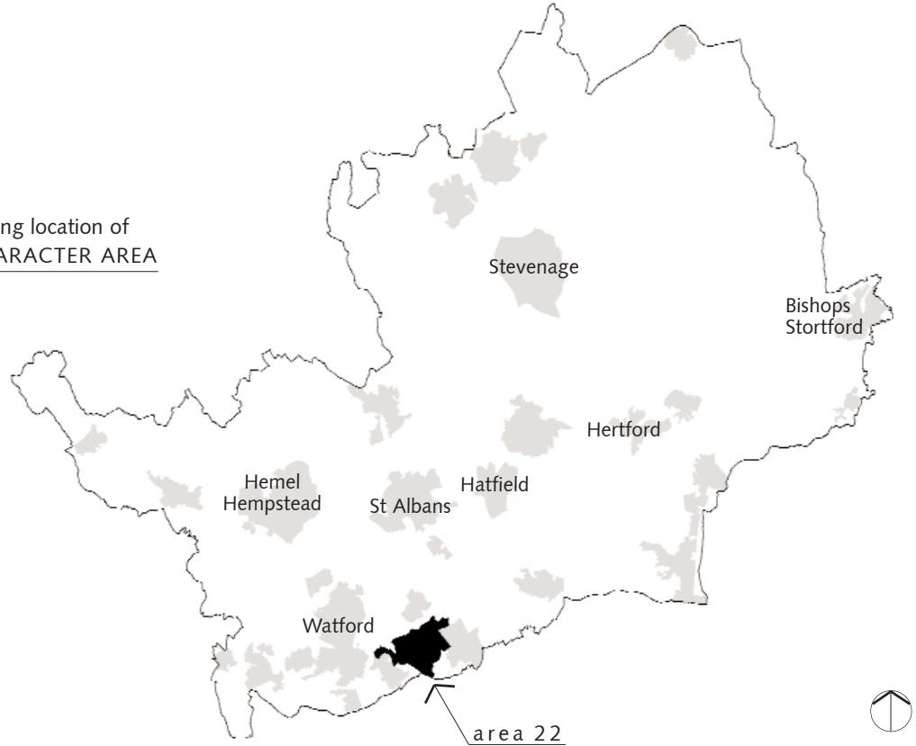
County map showing location of LANDSCAPE CHARACTER AREA