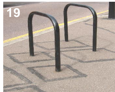
19. Good cycle rack colour and placement (Bushey High Street)

The County Council also have guidance on cycle parking provision that can be used for designing and implementing new cycle stands,