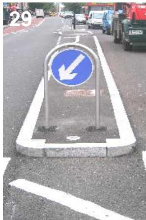
29. Hoop mounted keep left signs are preferred due to the sleek and visually simple appearance. (Image taken from the English Heritage publication 'Streets for all-East of England') / Manual for Streets.