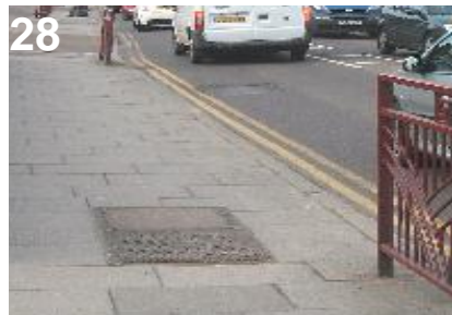
28. 100mm yellow lines should not be used in conservation areas due to their obtrusive nature (Radlett).