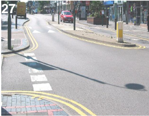
27. 100mm wide yellow lines on narrow road can dominate the street scene (Borehamwood).