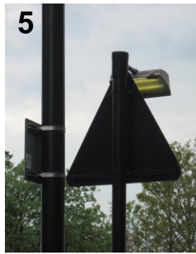
5. Numerous posts result in a proliferation on the footpath (Bushey)