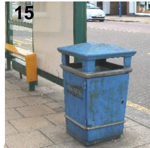
15. Better siting of a bin (High Street, Potters Bar).