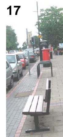
16 & 17. Note how the benches and the other pieces of street furniture have been placed in a neat, orderly row. Picture 18. Could the bench be turned 180 degrees to face the shops.