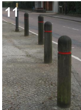
11. Good example of orderly placement of bollards (Shenley)