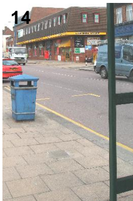
14. Less appropriate siting of a bin (High Street, Potters Bar).