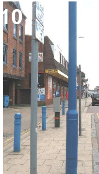
10. Orderly placement of bollards (background) is undermined by poor placement of parking meters, mounting poles, reducing the width of the pathway (Potters Bar)