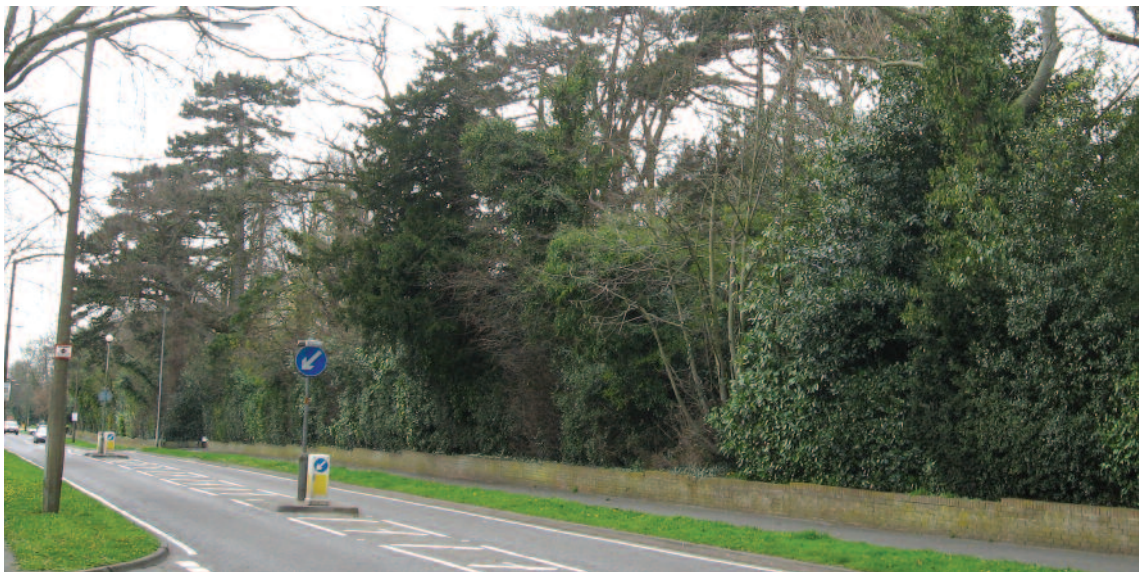
These TPO trees screen a development of flats from a busy public road and enhance the amenity of the area.