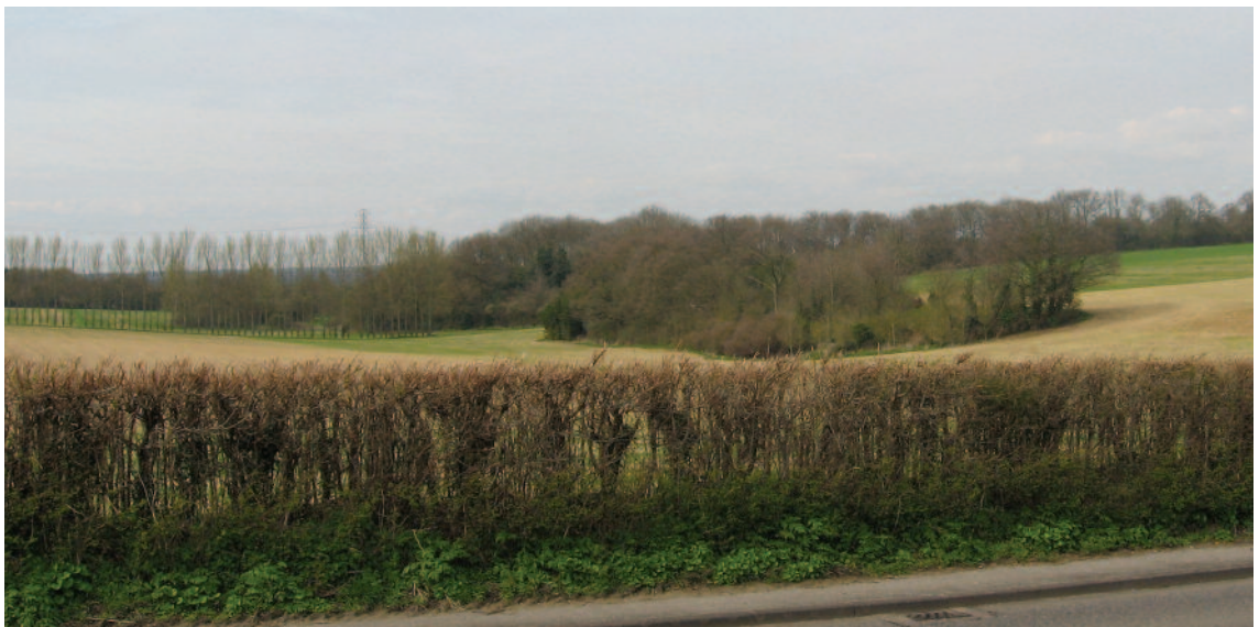
Protected woodlands that contribute to wider landscape views.