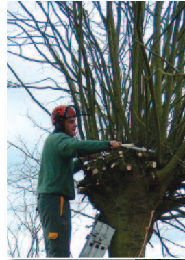
Cutting back a well managed pollard tree with 5 years growth back to the previous pollard point with a pruning saw - an example of high quality tree care.