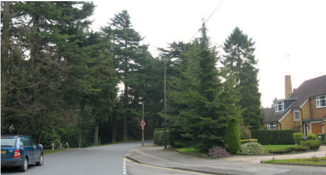
The protected Cedars at The Avenue, Radlett are a key part of the local landscape character and of high valuable to public amenity.