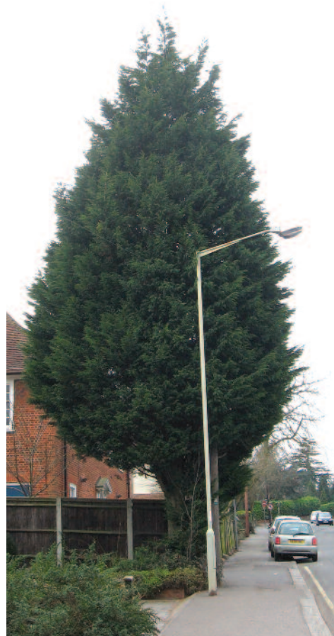
The wrong tree in the wrong place - a Leyland Cypress in a small garden in a Conservation Area. This tree would not be considered for a Tree Preservation Order.

11.14 If the Council decides to object to a proposal for tree works in a Conservation Area, applicants have no right to appeal, as the only power the Council has to protect the trees is to make a Tree Preservation Order. However, those affected by a new TPO will have an opportunity to object to the TPO, in which case the decision to confirm the TPO will be made by a planning sub-committee, at which the objections received by the Council will be heard.