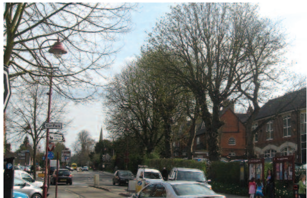
Protected trees significantly enhance the visual amenity of Radlett town centre.