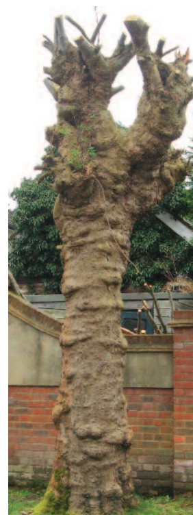
Badly pollarded tree with ugly branch stubs and torn cuts.