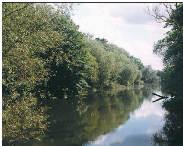
• Restored wetland, London Colney (J. Billingsley)

A broad and shallow basin of the upper River Colne, with some extensive panoramas over arable fields, both along the Vale and up towards Shenley Ridge to the south. Mixed land uses include arable, extensive areas of active and restored mineral extraction and urban fringe development. Areas of wooded farmland estate characterise the north-eastern part of the area.