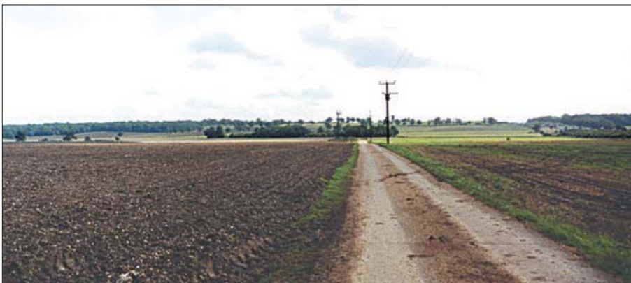
• Open arable fields towards Shenley Ridge