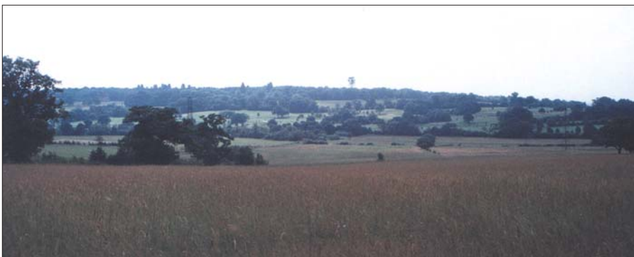
• Harrow Weald from Merry Hill