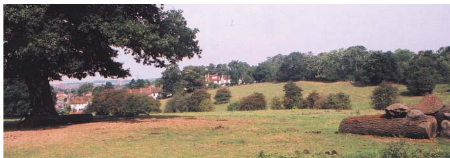
Haydon Hill Parkland •