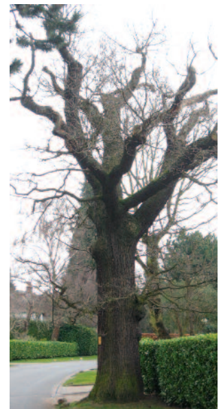
This mature oak has a mishapen crown and unnatural appearance due to previous heavy crown reduction. Tree surgey treatments like this should become a thing of the past.