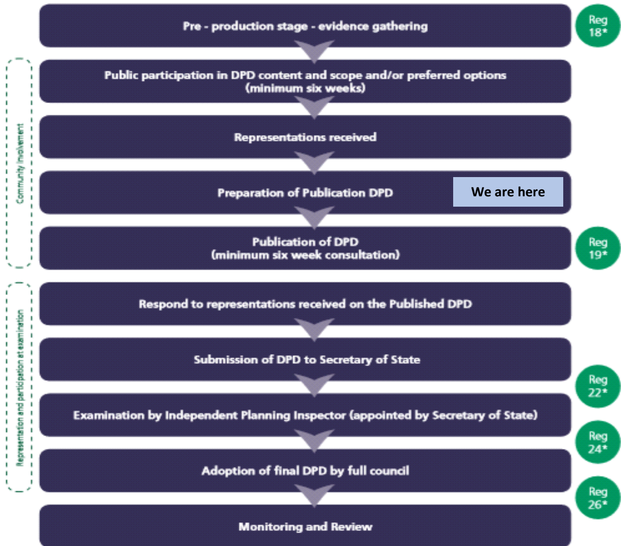
Figure 1: Key stages in preparing a Local Plan

* The Town and Country Planning (Local Planning) (England) Regulations 2012