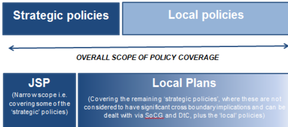
Figure 3: Relationship between the South West Herts JSP and Local Plans

4.37 Each council will continue to be responsible for preparing its own Local Plan, but the JSP will also provide the platform to consider how the challenges of growth in the wider South-West Hertfordshire area can be addressed longer term (i.e. to 2050). Figure 4 below illustrates how these two key planning documents will fit together.