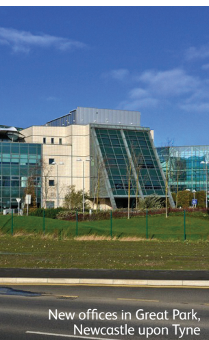
New offices in Great Park, Newcastle upon Tyne