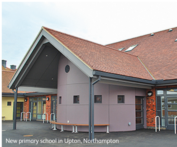
New primary school in Upton, Northampton