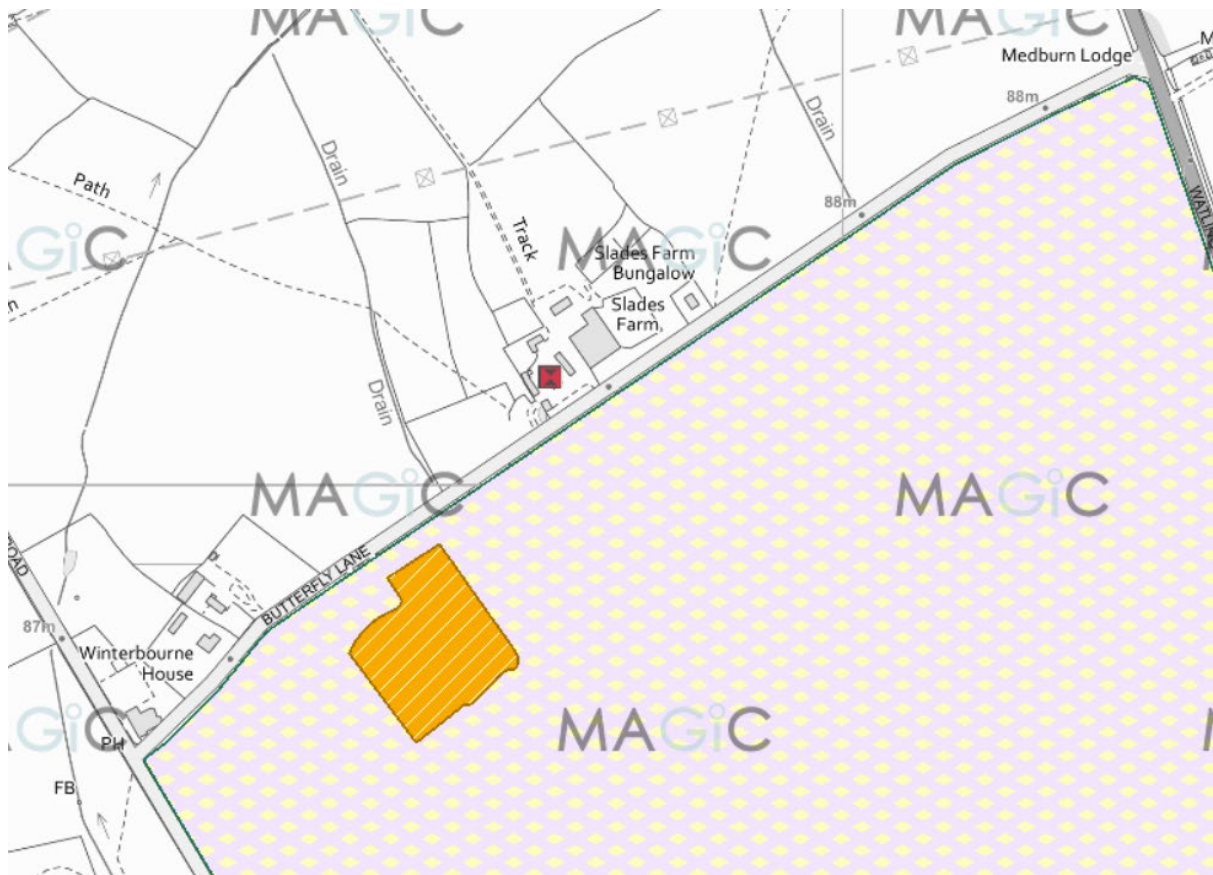
Figure 4: Environmental Designations – Listed House on wider site