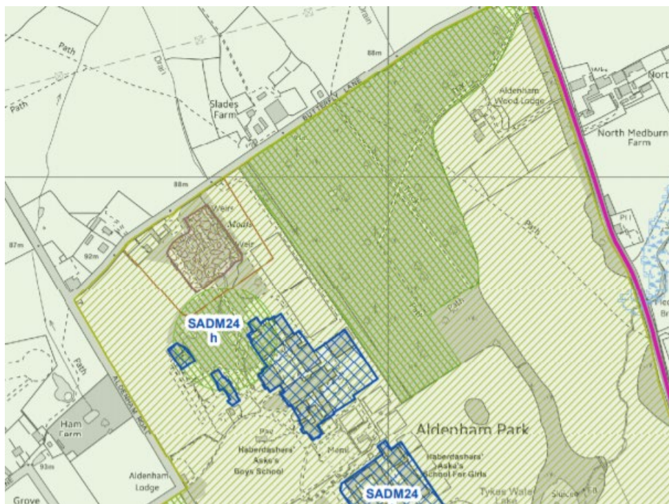
Figure 1: Policies Map – Site Located in the Green Belt