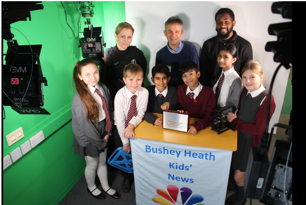
Figure 1: Digital Hub at Bushey Heath Primary School (BU4)