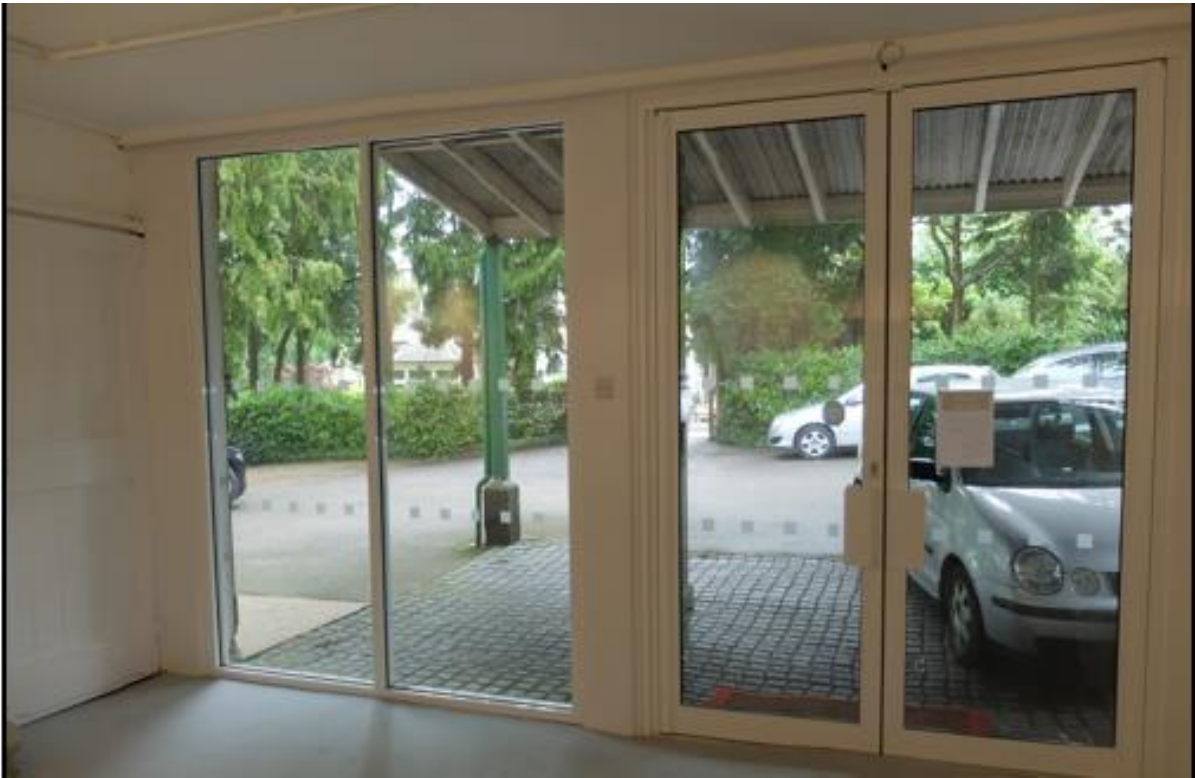
Figure 3: New community facility at Reveley Lodge (BU10)