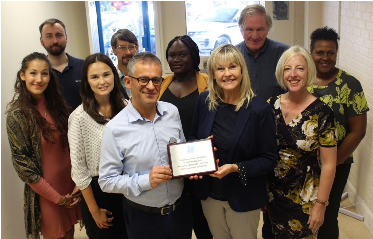
Figure 7: Plaque presentation at Borehamwood Wellbeing Centre (EB2)