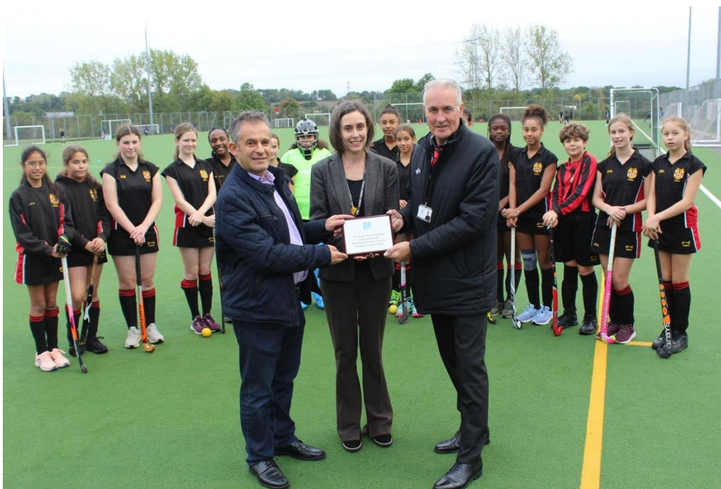
Figure 2: New AstroTurf facility at Dame Alice Owen's School (PB9)