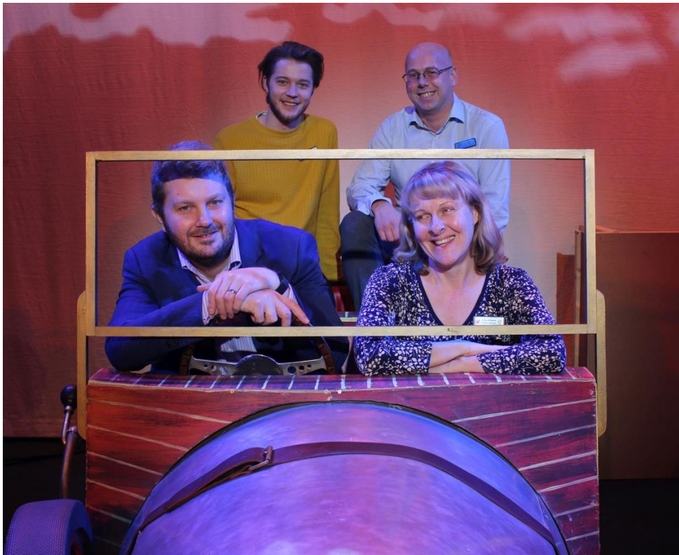
Figure 5: New staging at Wyllotts Theatre new stage (PB8)