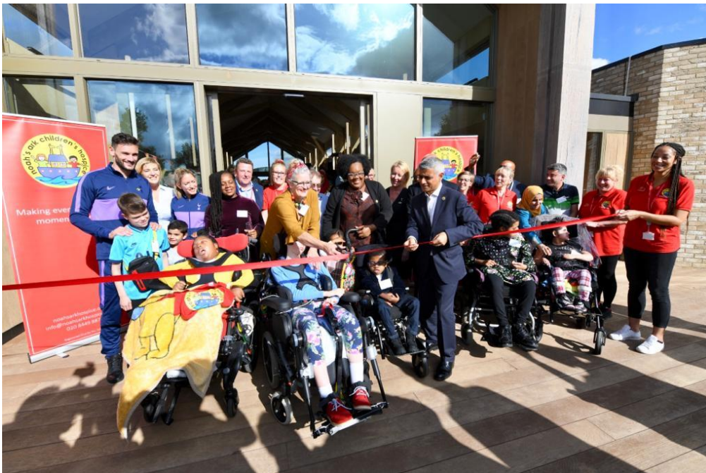
Figure 6: Opening day of Noah's Ark Children Hospice (OB1)