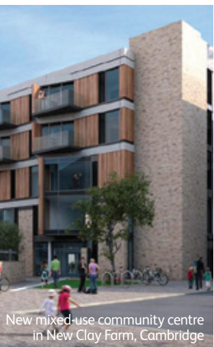
New mixed-use community centre in New Clay Farm, Cambridge