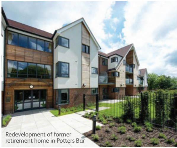
Redevelopment of former retirement home in Potters Bar