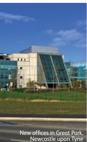
New offices in Great Park, Newcastle upon Tyne