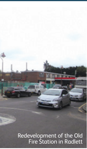
Redevelopment of the Old Fire Station in Radlett