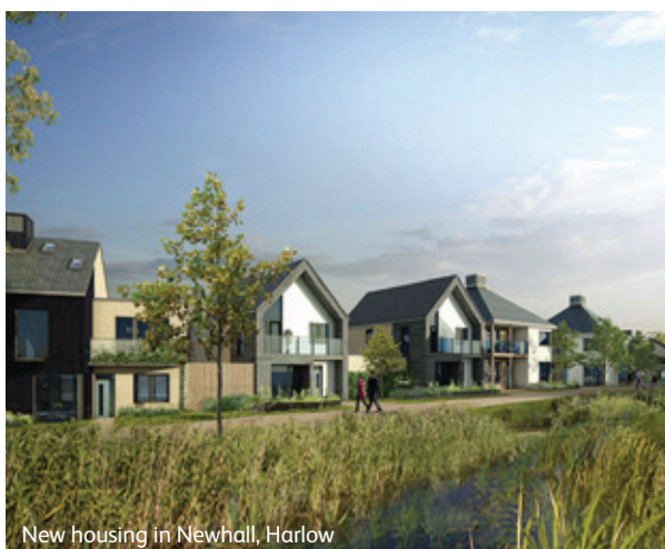
New housing in Newhall, Harlow