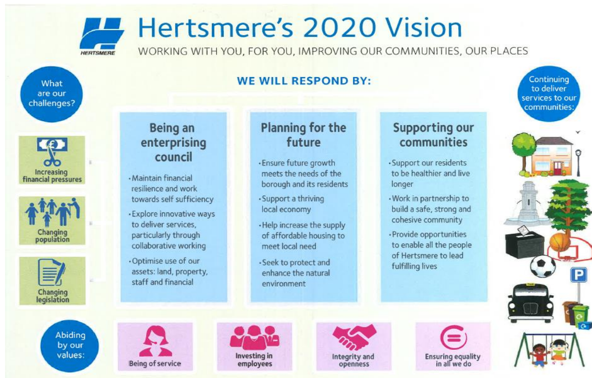
Figure 2 – Hertsmere’s 2020 Vision

The council’s annual corporate action plan for 2018-19 set out the key high level actions that the council undertook during the year. It highlights those projects which are over and above our day to day service delivery and will have an impact on our residents in either how services are delivered or how we generate income.