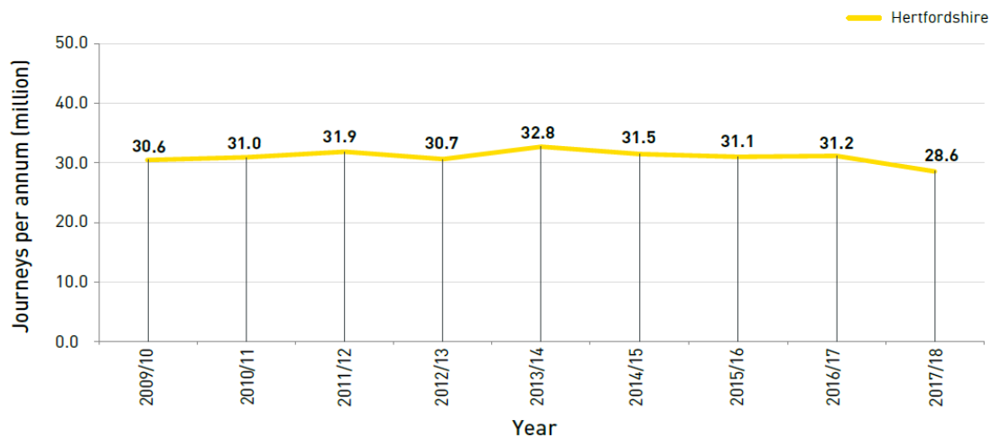
Figure 2 Passenger journeys on Hertfordshire bus services

national rate of 8.2% and it has since fallen further to 2.5%. In absolute terms, the local bus journeys in Hertfordshire are pretty much flat lined as shown in the following graph.