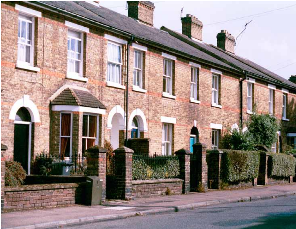
Urban character of Raynham Street in Hertford.