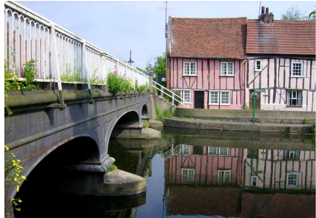
Traditional medieval timber-framed houses in Colchester, Essex.

Roman occupation has left a significant impact on the area. A major road, now the A12, connected the Roman capital at Colchester to London. Other major and minor Roman towns and cities include St Albans and Welwyn and there are extensive villa estates, notably in the west of the area (in Hertfordshire). Also in Hertfordshire, the distinctive settlement pattern of 'homestead moats' aligned with the grid pattern is thought to be influenced by Roman estate management techniques. The London Clay lowlands are also characterised by planned landscapes created during the Roman period, forming a still distinct rectilinear pattern of enclosure on the Dengie Peninsula and in the area between Thurrock and Wickford. By comparison, the central part of the NCA (the Essex wooded hills) was relatively sparsely settled. Orchards were established around Colchester, as well as a significant area of meadow pasture and leys following the numerous narrow rivers and streams.