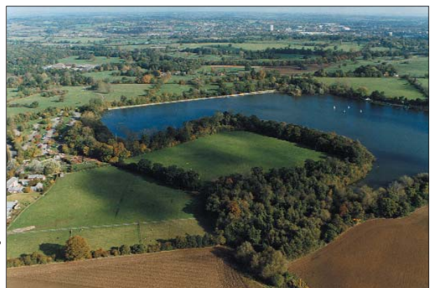
Aldenham Country Park • (Environmental Land Management Service (Rural Estates) HCC)