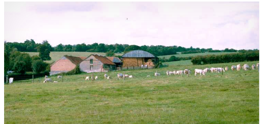
Mixed farming at Nyn Manor Farm in Hertfordshire.