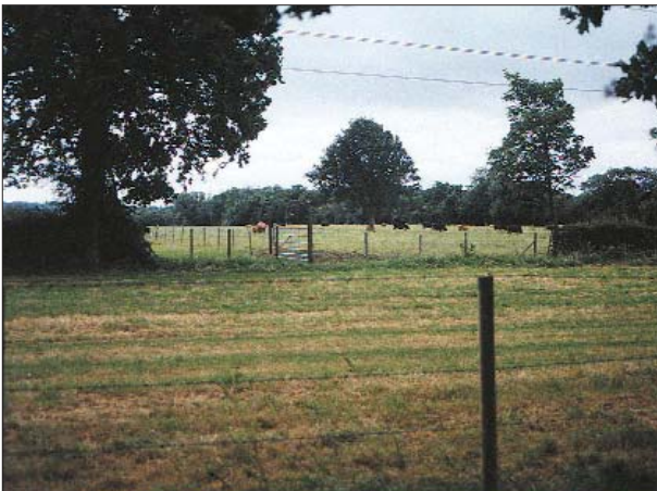
• Cattle at Kendal Hall Farm