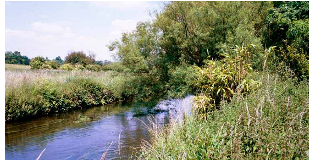
The River Lee near Hertford.