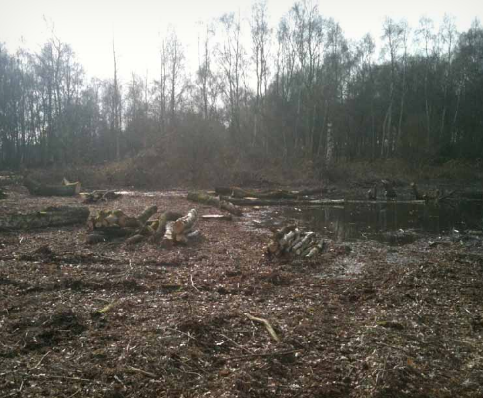
Restoration of acid heathland at Layer Breton in Essex.