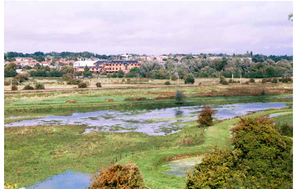
Grazing marsh at Kings Meads Valley Meadowlands alongside the urban landscape of Hertford.

While the plateaux are predominantly in arable use, the valleys by contrast contain areas of pasture and have a more intimate character, although some have been heavily modified by reservoirs, gravel workings, landfill sites and river realignments. The valleys contain all the main settlements within the area. Field boundaries are dominated by informal enclosure patterns of the 18th century, with thorn hedges relating to rationalisation and amalgamation of this pattern in the 18th and 19th centuries. It is a well-wooded landscape, especially to the east, with a number of ancient broadleaved woodlands including oak