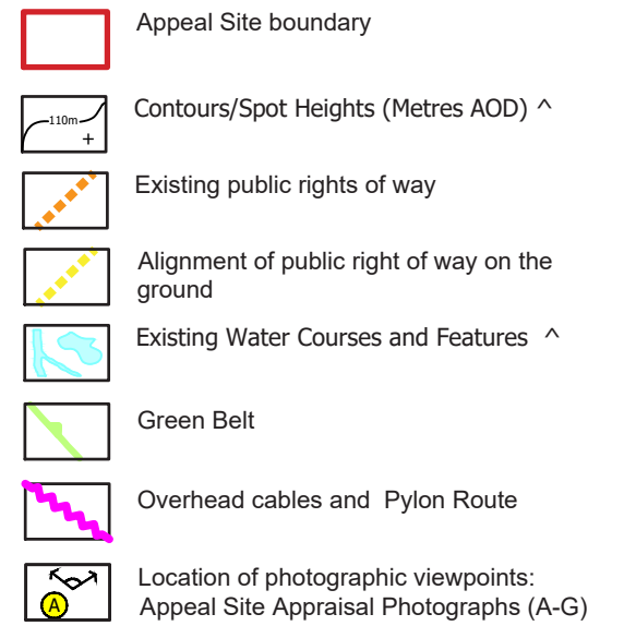
FIGURE PC- 4

Project Land at Little Bushey Lane, Bushey Drawing Title Appeal Site Appraisal Plan