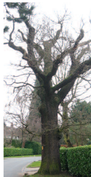
This mature oak has a mishapen crown and unnatural appearance due to previous heavy crown reduction. Tree surgey treatments like this should become a thing of the past.