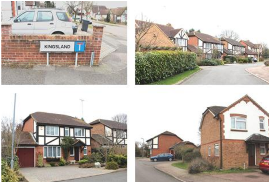
Figure 12 Kingsland