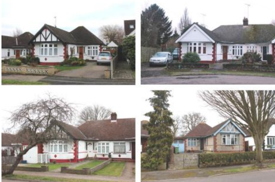
Figure 6 Clockwise from top left: 9 Elmroyd Avenue, 11 Elmroyd Close, 22 Oakroyd Close, and, 6 Oakroyd Avenue