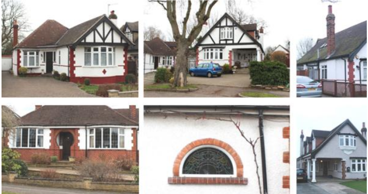
Figure 8 Examples of the architectural features

9.6 The architectural style of the buildings in the Conservation Area is characteristic of the interwar period, albeit with the added embellishment in some cases of Tuscan columns, stained glass window details, and distinctive 'Keyhole' doorways which add to their interest.