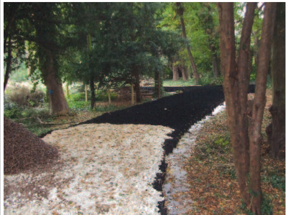
Use of a Cellular Confinement System to allow access for construction traffic through retained trees.