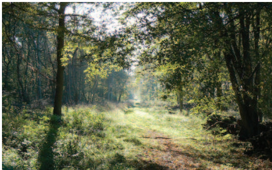
Balls Wood, Hertfordshire.