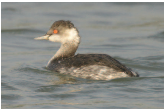
Black necked grebe.