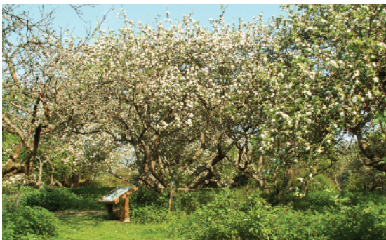
Terwin Orchard, Hertfordshire.