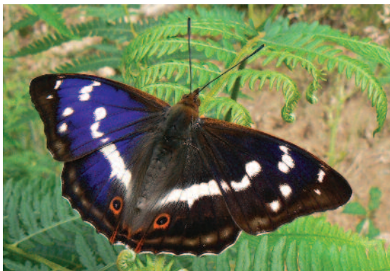
Purple Emperor Butterfly.