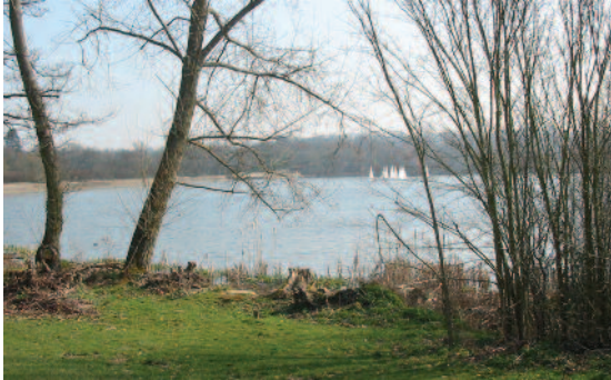
Wetland habitat, Aldenham Reservoir.