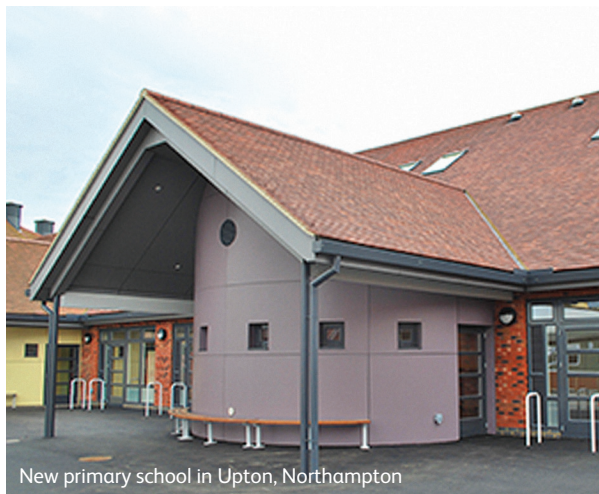
New primary school in Upton, Northampton