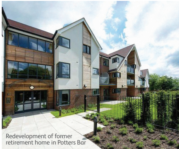
Redevelopment of former retirement home in Potters Bar