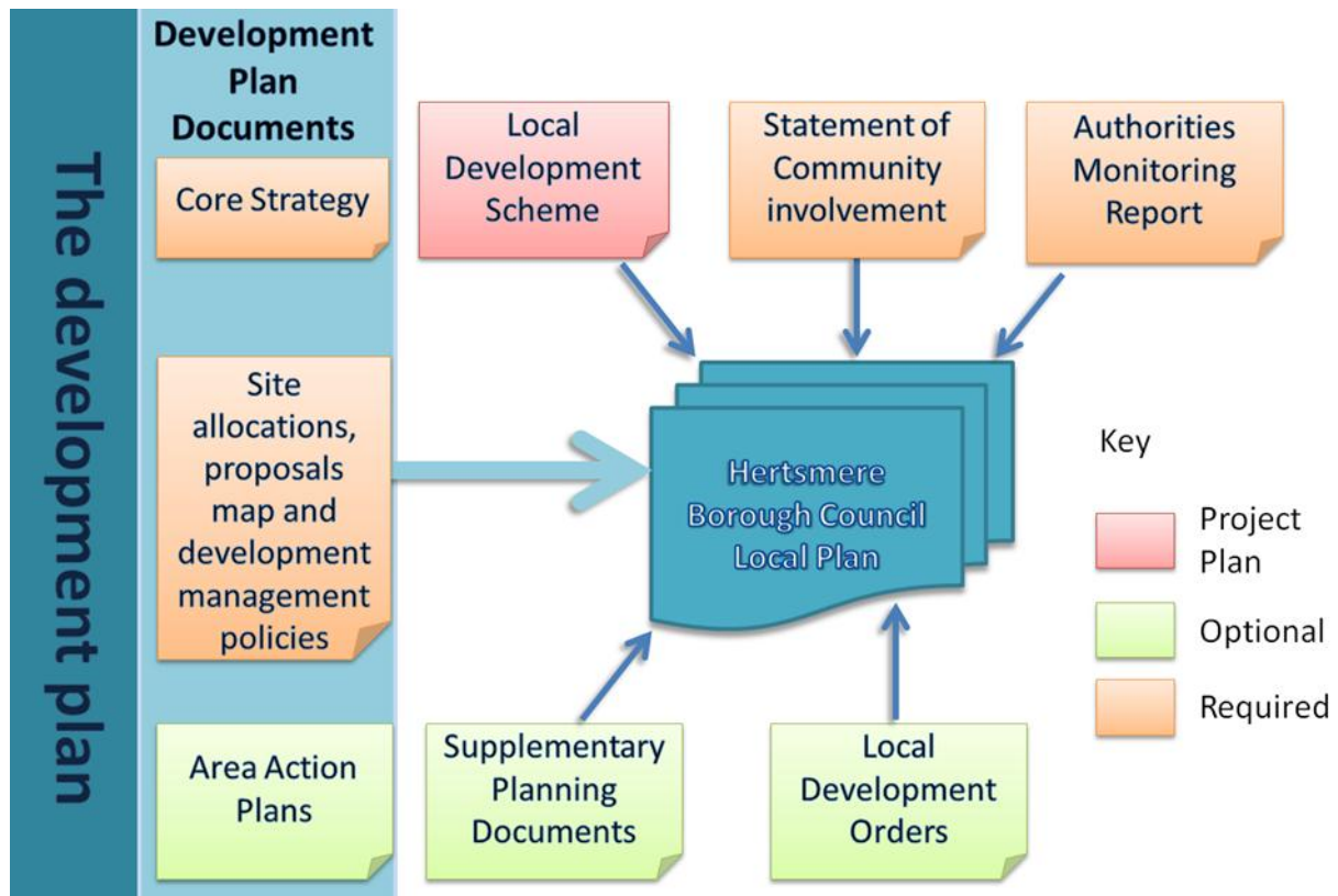
Figure 1: Hertsmere's Local Plan