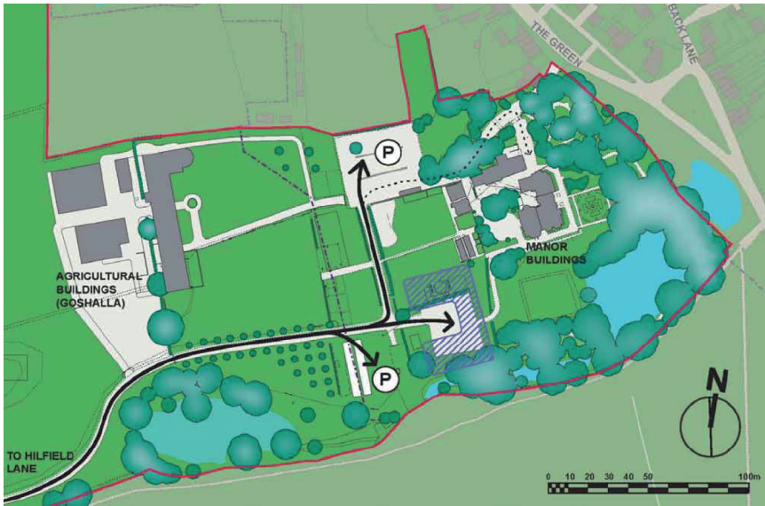
“Option 2 extended”