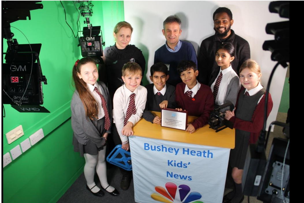
Figure 1: Digital Hub at Bushey Heath Primary School (BU4)