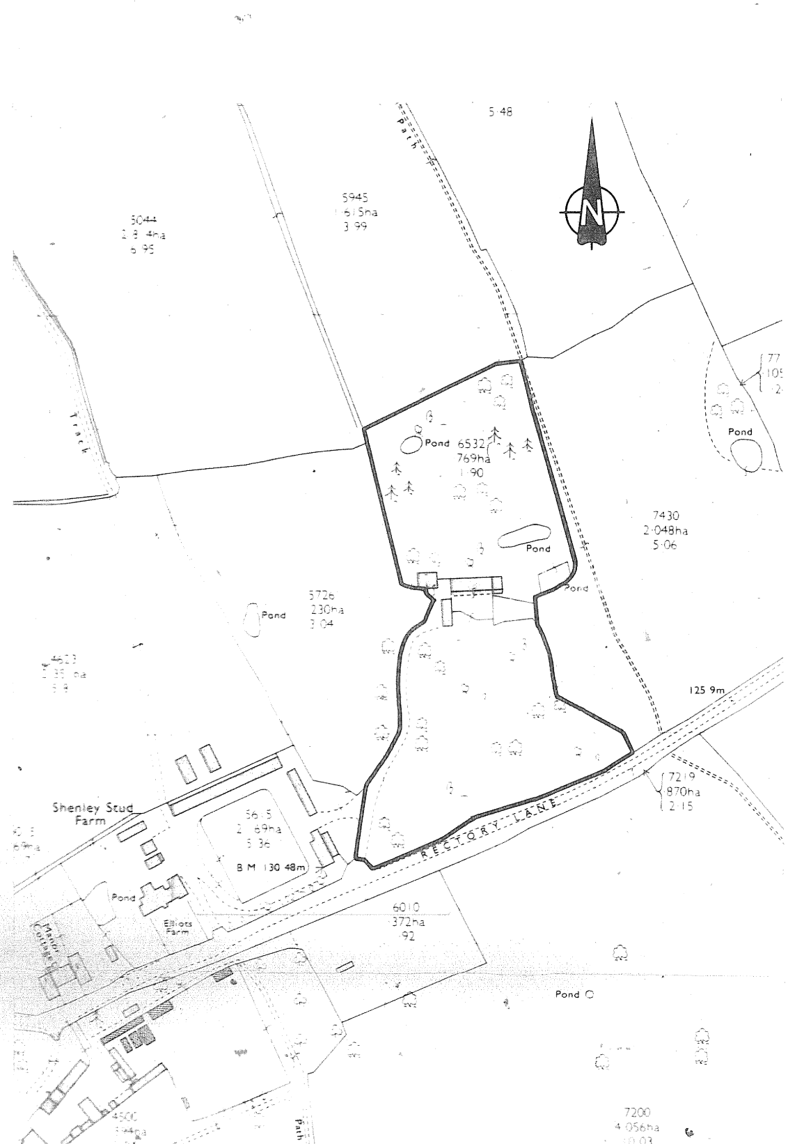
Location Plan Scale 1:2500

A1. AREA CONTAINING THE FOLLOWING SPECIES OF HOLLY, YEW, HORSECHESTNUT, SYCAMORE, ASH, ELM.