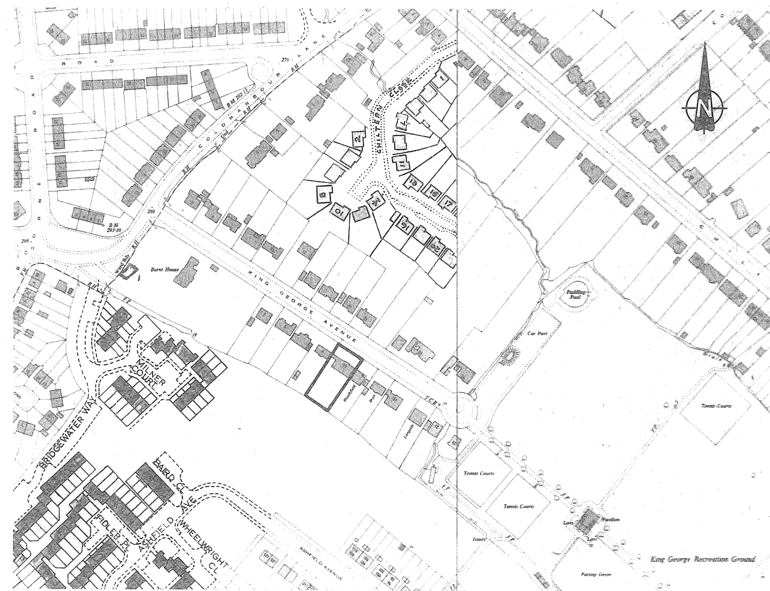
Location Plan. scale 1:2500

The Hertsmere Borough Council, in exercise of the within written powers conferred upon them in that behalf, hereby confirm the order.