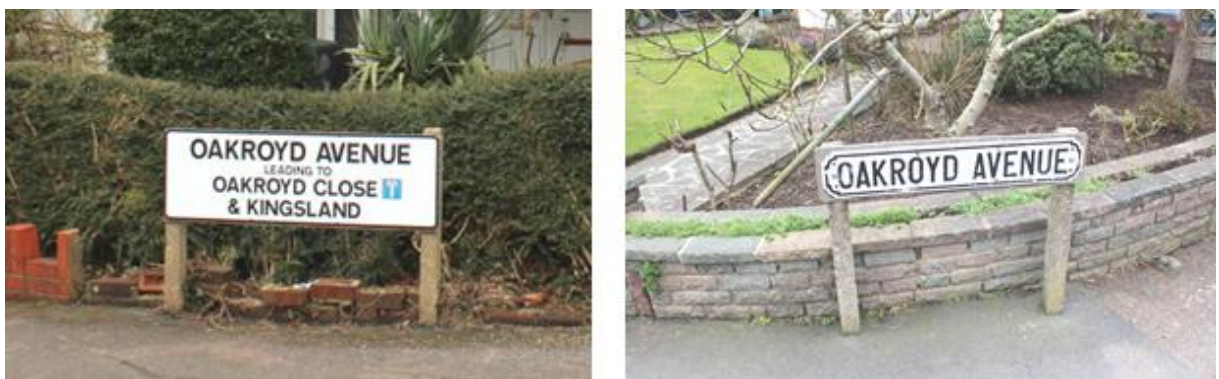
Figure 10 Modern signage (left), original signage (right)

10.5 Signage within the estate itself is minimal, and road name signs are of a design in keeping with the character of the Conservation Area. Along Baker Street modern road signs have been installed which detract from the historic character of the Area.