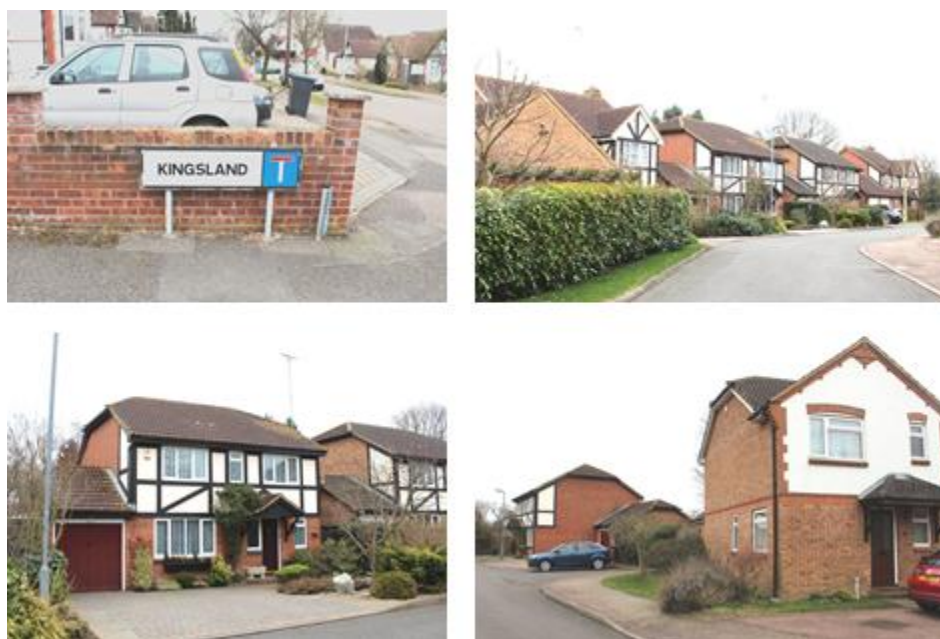
Figure 12 Kingsland