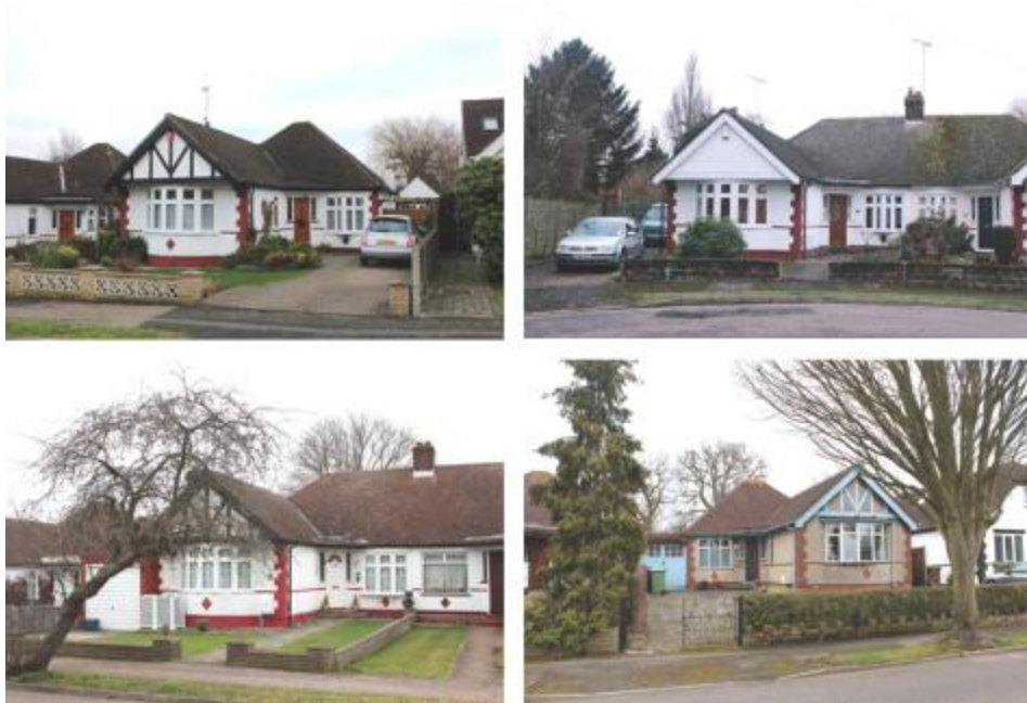
Figure 6 Clockwise from top left: 9 Elmroyd Avenue, 11 Elmroyd Close, 22 Oakroyd Close, and, 6 Oakroyd Avenue

9.6 Historically many of the garages were sited well to the rear of the building line, had pitched tiled roofs and double doors with glazing in their upper panelling, very typical of the inter-war and immediate post war style. The garages which retain their historic doors contribute significantly to the character of the Conservation Area, but a number of them have either been converted into other uses, or have had modern garage doors installed. More modern garages are often located further forward, in line with the front of the houses or indeed in one or two cases in front.