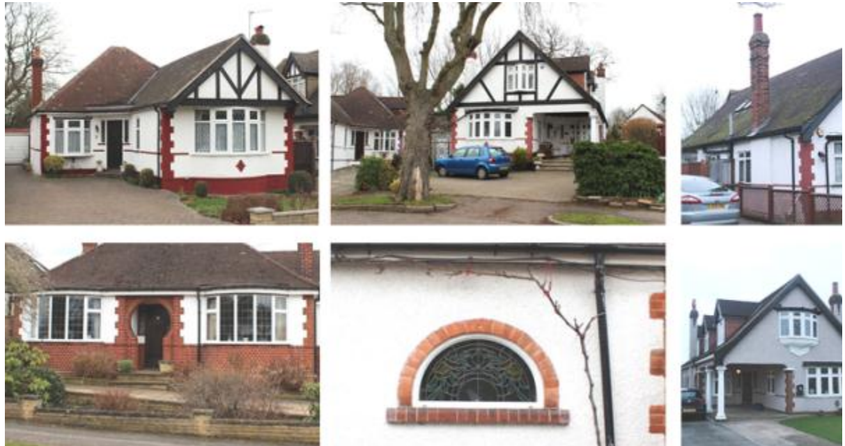
Figure 8 Examples of the architectural features

9.7 The architectural style of the buildings in the Conservation Area is characteristic of the interwar period, albeit with the added embellishment in some cases of Tuscan columns, stained glass window details, and distinctive 'Keyhole' doorways which add to their interest.