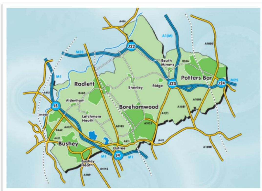
Map 2 - Map of Hertsmere Borough