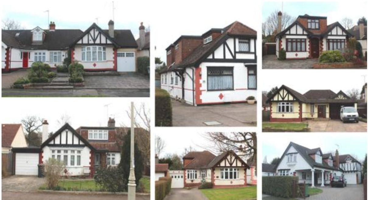
Figure 9 Examples of inappropriate alterations