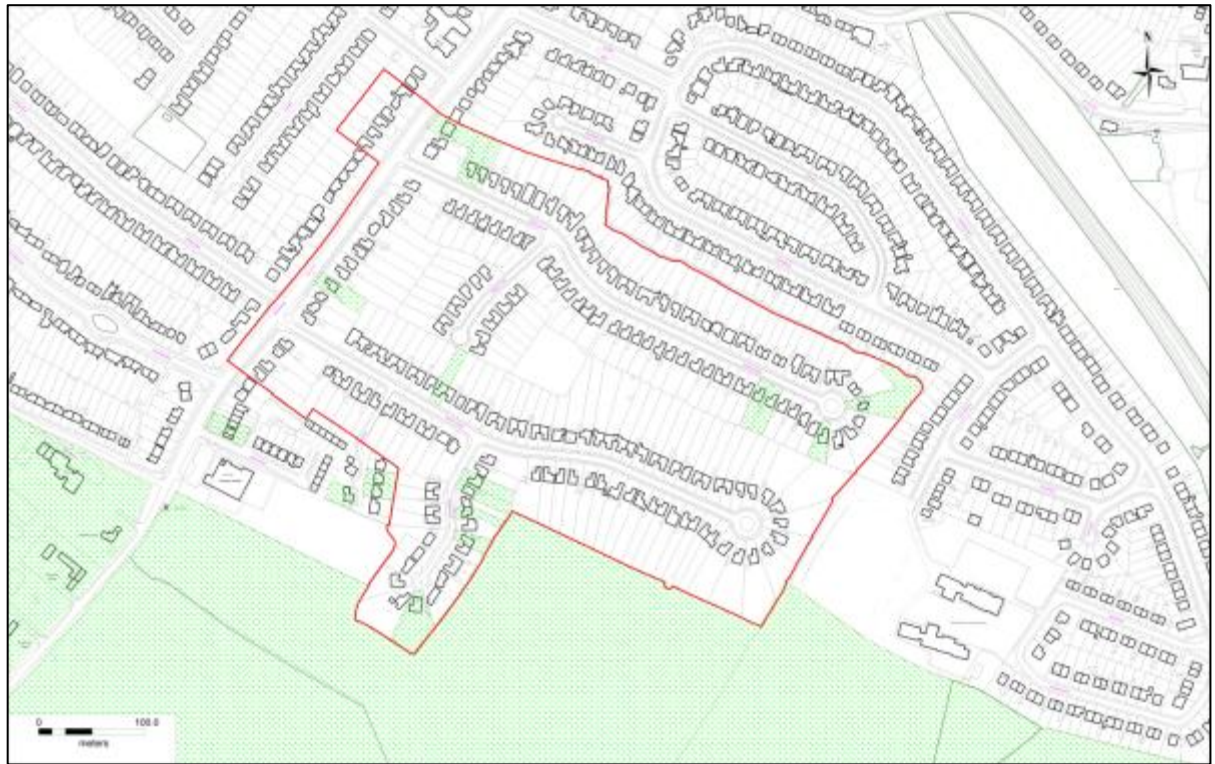
Map 4 - The Tree Preservation Orders in force in the Conservation Area.