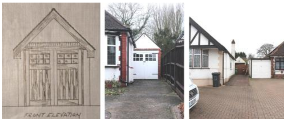
Figure 7 Left to right: E Hicks garage design; garage at 35 Elmroyd Avenue, garages at 51 & 53 Oakroyd Avenue

9.6 Historically many of the garages were sited well to the rear of the building line, had pitched tiled roofs and double doors with glazing in their upper panelling, very typical of the inter-war and immediate post war style. The garages which retain their historic doors contribute significantly to the character of the Conservation Area, but a number of them have either been converted into other uses, or have had modern garage doors installed. More modern garages are often located further forward, in line with the front of the houses or indeed in one or two cases in front.