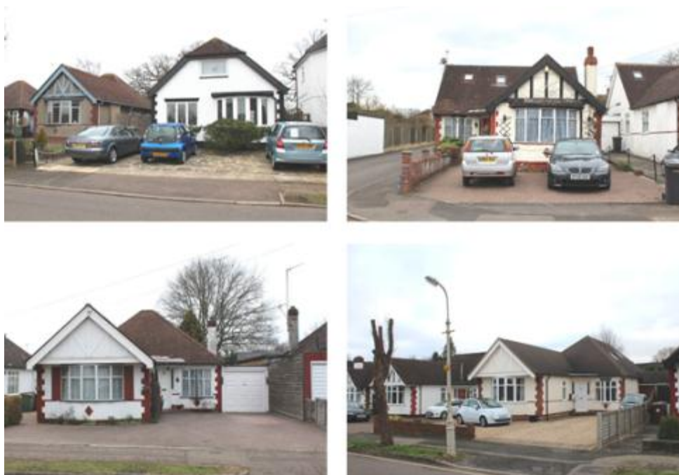
Figure 11 Examples of inappropriate landscaping

10.6 Part of the charm and character of the original estate was the neat design of the front garden and boundary wall and gate which is characteristic of this period of construction in the 1930s. Under pressure from increasing numbers of cars per household many gardens and frontages have been altered to accommodate larger numbers of cars on the drive way and garden area, which detracts from the historic character of these particular houses and reduces the aesthetic quality of the area.