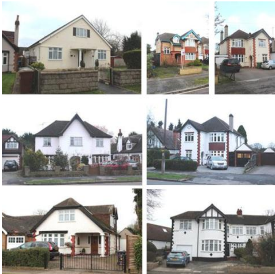
Figure 5 Top row: 2, 50 & 52 Elmroyd Avenue; middle row: 62 & 82 Baker Street; and, bottom row: 3 Oakroyd Avenue and 10 Oakroyd Close

9.5 The buildings are predominantly set back from the road, allowing for generously proportioned front gardens and driveways, leading back in many cases to small garages. The original front boundaries, as seen in the brochure, would have consisted of low, crenelated brick wall with a wooden gate, very typical of the period. None of these have survived intact, although there are many modern variations on a similar theme, and a few have been replaced with thick garden hedges.