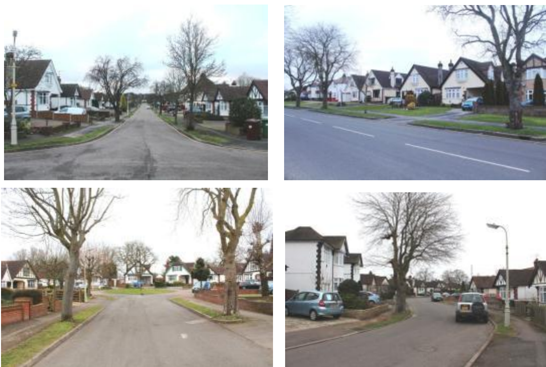
Figure 1 Clockwise from top left: Elmroyd Avenue looking down; along Baker Street; looking down Oakroyd Close; and, looking up Oakroyd Avenue

7.3 The Area lacks a well-defined focal point due to its spatial layout.