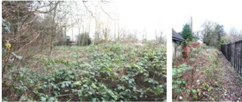
Figure 2 Rectangular area of land between Oakroyd and Elmroyd Avenue, originally allotments