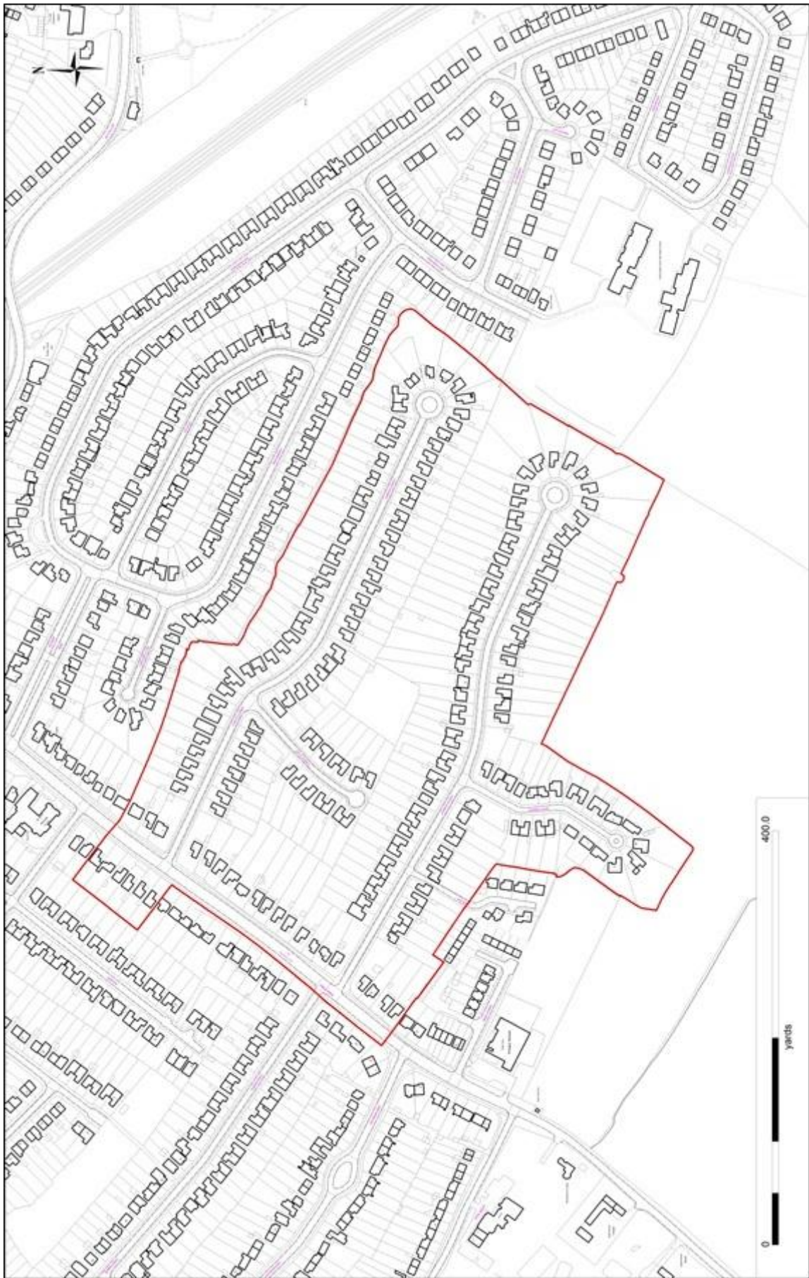
Map 1 – Map of the ‘Royds Estate’ Conservation Area (Courtesy of Hertsmere Borough Council)