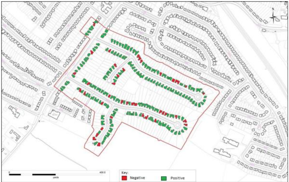
Map 5 Map showing positive and negative buildings within the Conservation Area