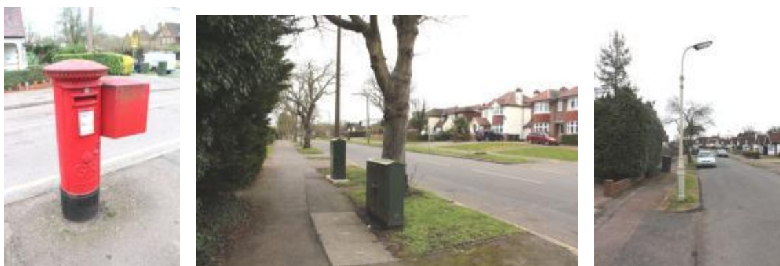
Figure 3 Left to Right: Georgian Royal Mail Pillarbox; BT 'green box' cabinets; and period lamp post.