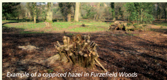
Example of a coppiced hazel in Furzefield Woods

In recent years the new hazel shoots have suffered from severe browsing damage by rabbits and deer. To protect the re-growth, temporary fencing will be erected around the cut stumps and many new hazel saplings will be planted. To visit the site and find out more about it, view the site leaflet at: www.hertslink.org/cms/getactive/placestovisit/furzefield/