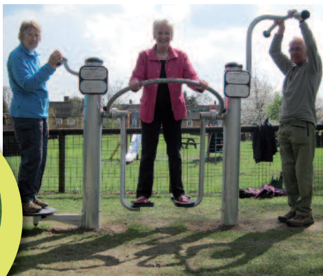
Pictured are members of the Friends of Potters Bar Parks trying out the equipment in Oakmere Park

Affinity Sutton Housing Association is funding a new gym at Ripon Park in Borehamwood which should be open this winter. More details will be published in the next newsletter.