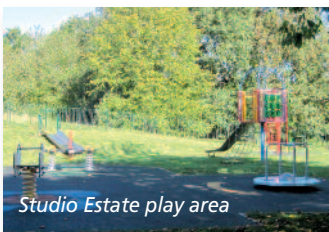
Studio Estate play area