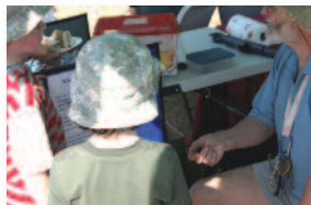
Children learning about bats

The Friends of Fishers Field is celebrating over 15 years since its inception. The group works tirelessly to conserve, develop and promote Fishers Field Nature Reserve for the benefit of the wildlife, which in turn benefits the local community.