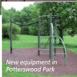
New equipment in Potterswood Park

funded by a local development (known as a Section 106 agreement).