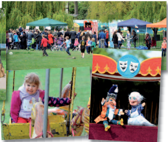
Pictured are scenes at the King George Recreation Ground centenary celebrations

The year quickly moved on towards the summer months, bringing with it the Bushey Festival. There were many favourite events from past years such as the teddy bears picnic and the dog show, as well as new additions including the Jim Phillips Jazz Band and Tai Chi in the Rose Garden.