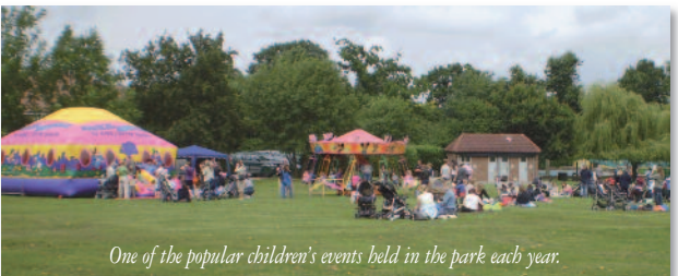
One of the popular children's events held in the park each year.

Recent additions to the park include fitness equipment, table tennis and challenging equipment for teenagers. A wide events programme continues, including the annual dog show, marathon, teddy bears' picnic and family fun days. Regular activities are held with charities and local community groups such as Mencap and Herts Inclusive Theatre.