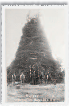
The principal celebrations of the Coronation of George V in Bushey were a carnival and bonfire.

By 1912 Bushey's population had grown to over 7,000 from well under 1,000 in 1812. King George V had succeeded to the throne in May 1910 and there was a mood of optimism in the air. There was growing awareness of the importance of access to outdoor exercise in clean, fresh air for the benefit of overall public health and well-being.