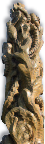
The 'Caterpillar Column'

Secure public toilets were also installed and, for the first time, outdoor art was introduced into the park. The old pavilion was rebuilt as a fully-equipped café and is now called La Dolce Vita.