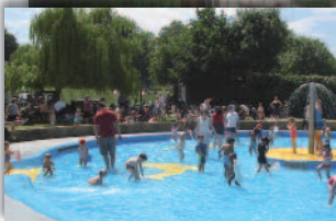
The paddling pool before and after the refurbishment.

The land drains were renewed and extended and the old footpaths were widened and relaid. From the main entrance up to and beyond the old pavilion, the avenue of lime, oak and beech trees was extended up to the south-east entrance in Somers Way flanked by plane trees.