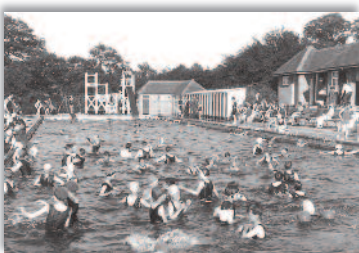
Swimmers enjoyed the cold water of the pool, late 1920s.

In the early 1920s, two more fields were acquired, thus doubling the Rec to 22 acres. An open-air swimming pool was built, filled with chlorinated water, and in July 1925 opened amid much civic ceremony. Tennis courts and a putting green were installed and extra play equipment was placed at the high end of the enlarged Rec.