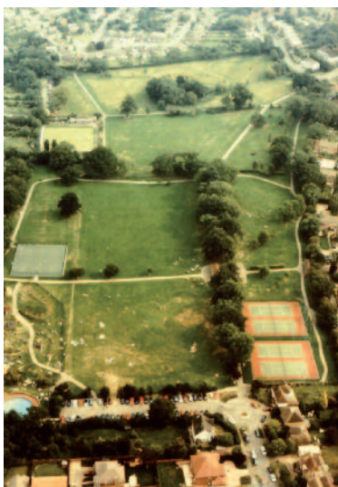
In 1912, King George Recreation Ground comprised the two fields in the foreground of this 1990s photograph. The two fields beyond were added in the early 1920s.

The council negotiated a price of £2,000 with the Church Commissioners. Contractors then put in land drains and footpaths, marked out football and cricket pitches, installed play equipment and built a refreshment hut, bandstand, changing rooms and a caretaker's lodge at the entrance to the site in King George Avenue. The work was begun in the summer of 1911.