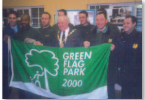
The park received the prestigious Green Flag Award in 1999/2000.

A key feature of the management plan was the establishment of a 'Friends' organisation' to represent residents and users and to act as a conduit between them and the council. An inaugural meeting was held in 1997, a committee elected, a constitution adopted and the Friends of King George Recreation Ground was born.