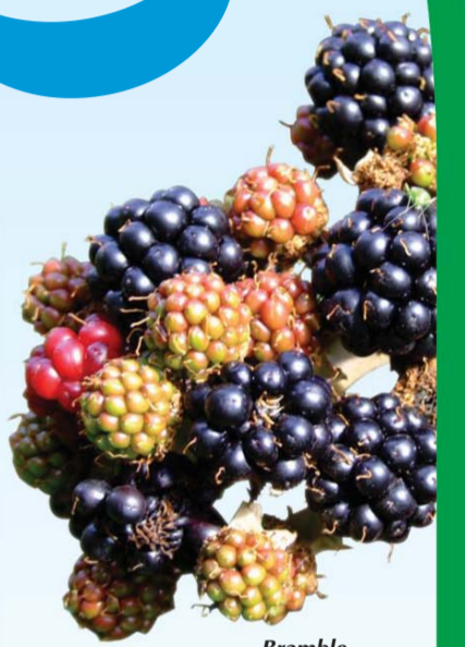
Bramble - Rubus fruticosus