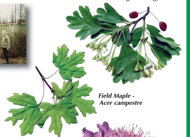
Field Maple - Acer campestre