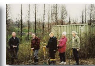
The Friends hard at work