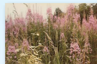
Great Willowherb Epilobium hirsutum

The meadow area was created in 2001 by the Friends and Countryside Management Service thanks to funding from a Local Agenda 21 Community Grant. In the meadow you will find a wide array of flowers and fine grasses including yarrow, field scabious, marjoram, lesser knapweed and toadflax.