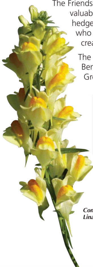
Common Toadflax - Linaria vulgaris