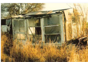
This picture shows the disused allotments before the Friends of Fisher's Field and Hertsmere became involved

The site can be accessed by foot from Fishers Close off Bendysh Road and via footpath number 2 from Greatham Road and footpath 66 from Park Close.