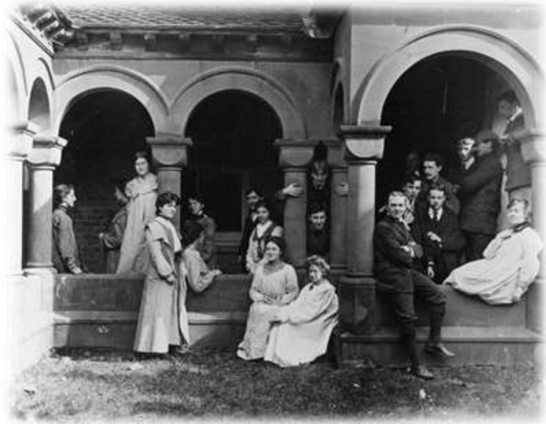
Herkomer's students in the cloisters

During the latter part of the 19th Century many notable artists lived in Bushey. From 1883 until 1904 the rose garden was the site of an art school established by Sir Hubert von Herkomer RA, an eminent Victorian artist