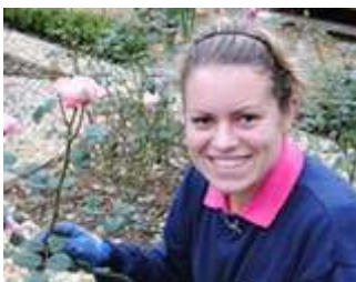
Ami the Gardener

High street railings - new railings were fitted to the top of the existing wall and the original gate was treated and refitted.