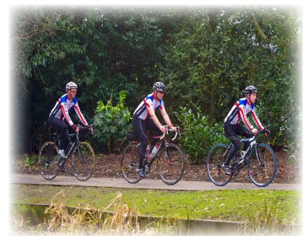
Parkfield, Potters Bar