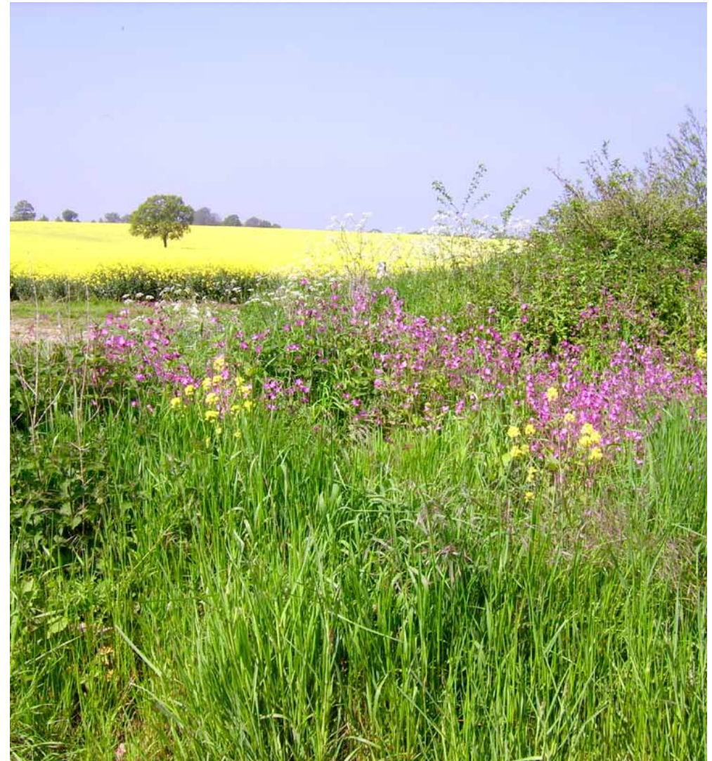
Farmland next to the River Colne in Essex.

The main opportunities available to this area are the continuation of the agricultural tradition, but within this land management should consider methods that are more sustainable in terms of water use and soil quality in order for it to continue to be a viable industry in the future. The areas of various semi-natural habitats also present opportunities to improve water storage and soil quality for surrounding agricultural land as well as to increase advantageous species that will aid pollination and reduce pest species. In addition to this the woodlands in the area could be an important resource to supply timber and fuel to the local area if they were managed effectively.