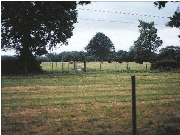
• Cattle at Kendal Hall Farm