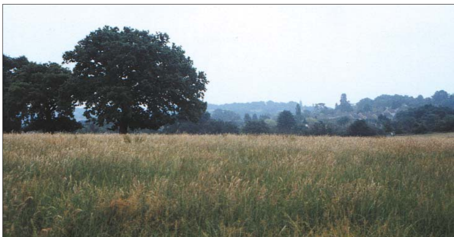
• Wooded skyline at Elstree