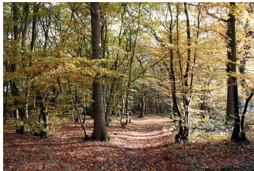
Ancient woodland at Pound Wood in Benfleet, Essex.

SEO 4: Manage and expand the significant areas of broadleaf woodland and wood pasture, and increase tree cover within urban areas, for the green infrastructure links and important habitats that they provide, for the sense of tranquillity they bring, their ability to screen urban influences and their role in reducing heat island effect and sequestering and storing carbon.