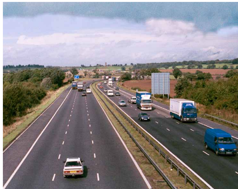
Major transport links include the M25 motorway.

A small part of the Dedham Vale Area of Outstanding Natural Beauty (AONB) straddles the eastern edge of this NCA, the more northerly South Suffolk and North Essex Claylands and the south-western tip of the Suffolk Coast and