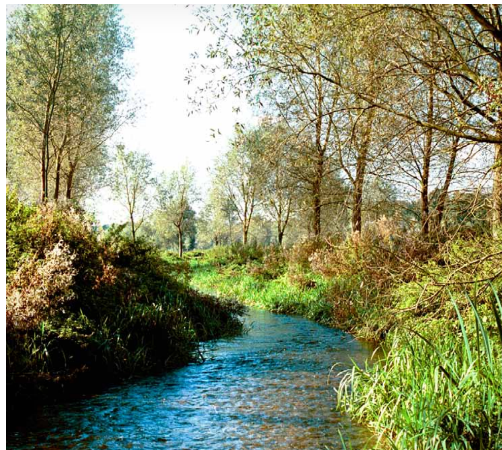
River Ver chalk stream near Drop Lane in Hertfordshire.

Biodiversity and geodiversity are crucial in supporting the full range of ecosystem services provided by this landscape. Wildlife and geologically-rich landscapes are also of cultural value and are included in this section of the analysis. This analysis shows the projected impact of Statements of Environmental Opportunity on the value of nominated ecosystem services within this landscape.