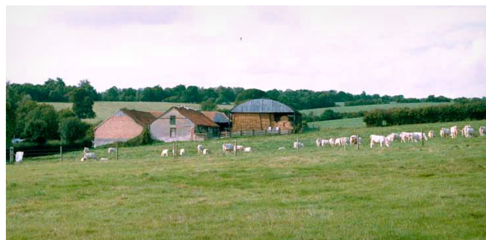
Mixed farming at Nyn Manor Farm in Hertfordshire.