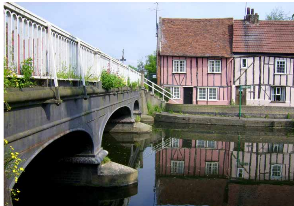
Traditional medieval timber-framed houses in Colchester, Essex.

Roman occupation has left a significant impact on the area. A major road, now the A12, connected the Roman capital at Colchester to London. Other major and minor Roman towns and cities include St Albans and Welwyn and there are extensive villa estates, notably in the west of the area (in Hertfordshire). Also in Hertfordshire, the distinctive settlement pattern of 'homestead moats' aligned with the grid pattern is thought to be influenced by Roman estate management techniques. The London Clay lowlands are also characterised by planned landscapes created during the Roman period, forming a still distinct rectilinear pattern of enclosure on the Dengie Peninsula and in the area between Thurrock and Wickford. By comparison, the central part of the NCA (the Essex wooded hills) was relatively sparsely settled. Orchards were established around Colchester, as well as a significant area of meadow pasture and leys following the numerous narrow rivers and streams.