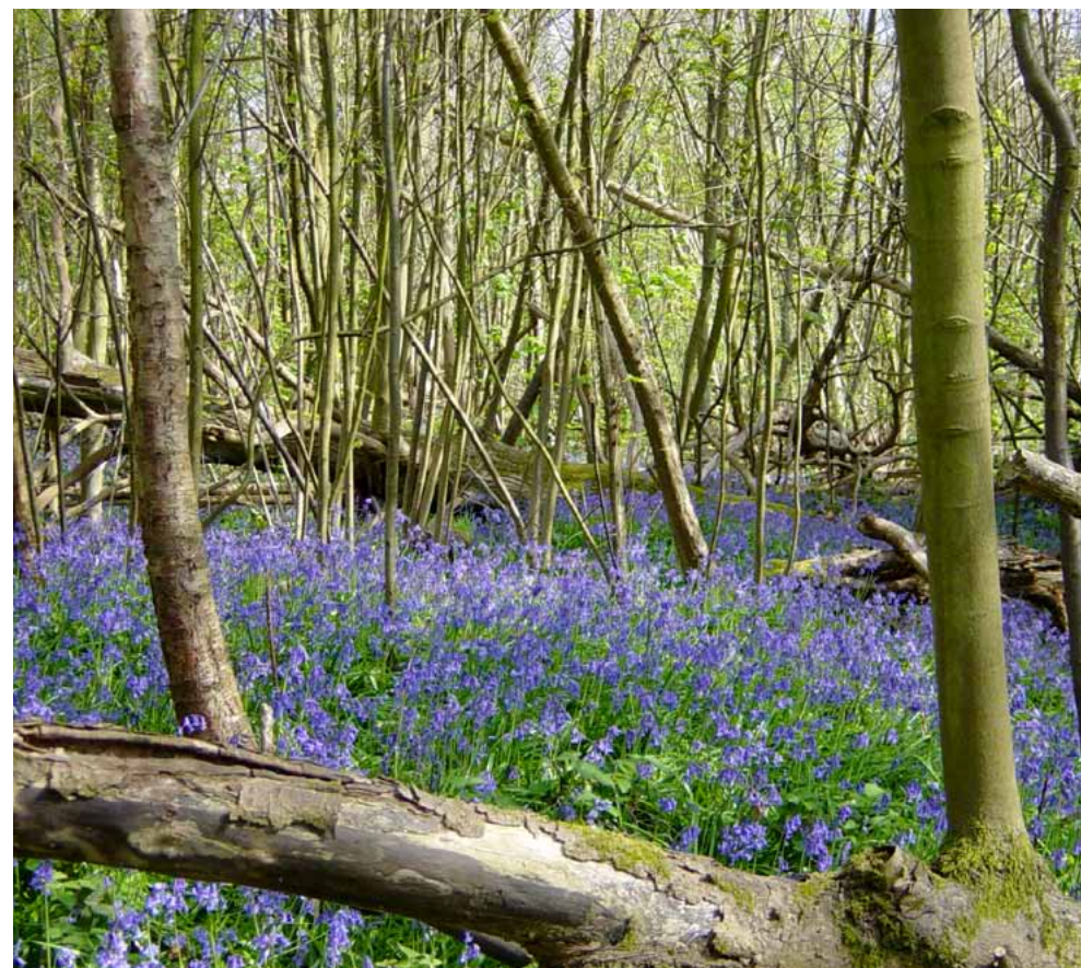
Mixed coppice ancient woodland at Norsey Wood near Billericay, Essex.

In the 1970s Dutch elm disease transformed many parts of the landscape, with the loss of tree and woodland cover, and the area continues to change with pressure for housing and industrial growth associated with, for instance,