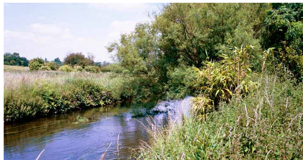
The River Lee near Hertford.