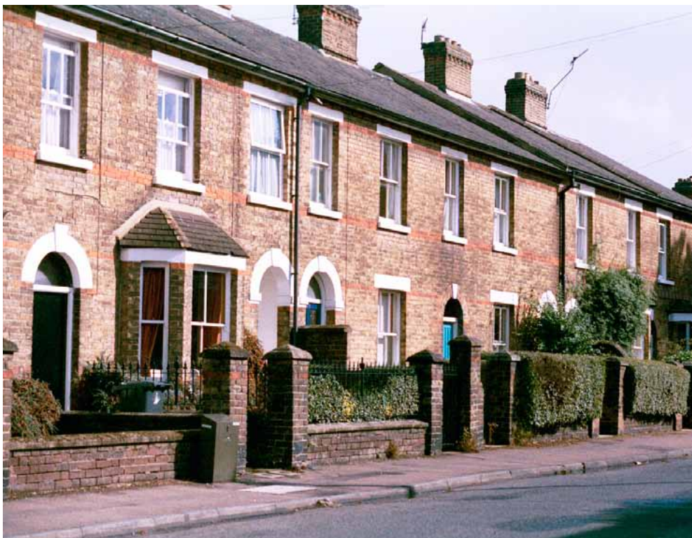
Urban character of Raynham Street in Hertford.