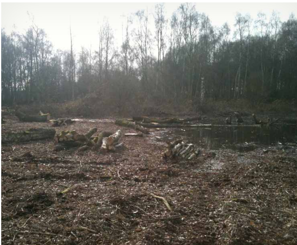
Restoration of acid heathland at Layer Breton in Essex.