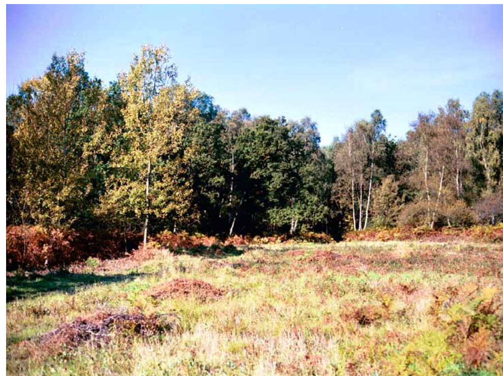
Wet heathland, acid grassland and coppiced ancient woodland at Bricket Wood Common, Hertfordshire.

The east of the area is characterised by a planned Roman landscape with a rectilinear pattern of fields which is a nationally important but subtle feature