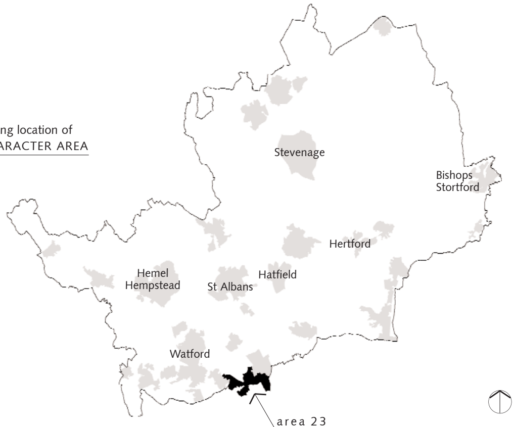
County map showing location of LANDSCAPE CHARACTER AREA