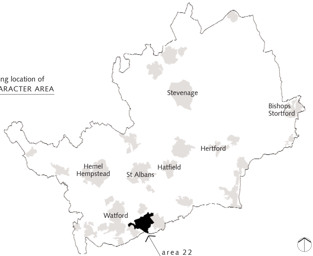
County map showing location of LANDSCAPE CHARACTER AREA