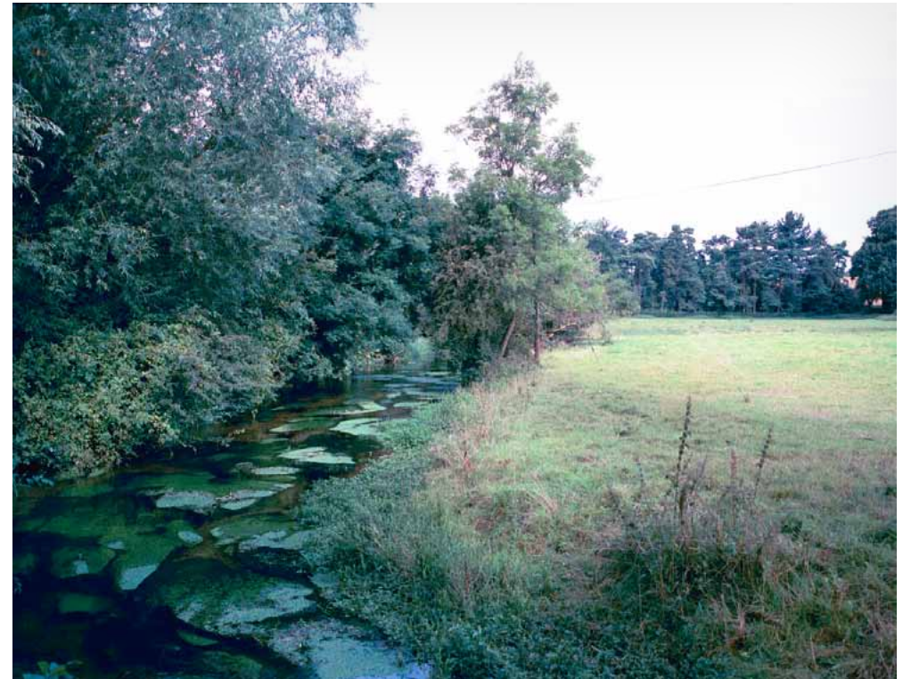
River Mimram valley flood plain, Hertfordshire.