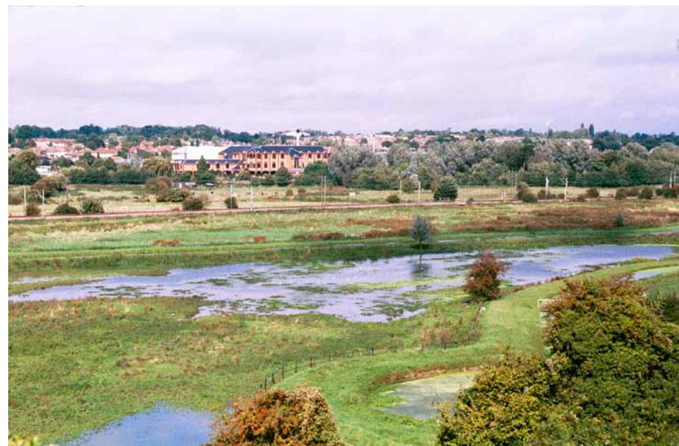
Grazing marsh at Kings Meads Valley Meadowlands alongside the urban landscape of Hertford.

While the plateaux are predominantly in arable use, the valleys by contrast contain areas of pasture and have a more intimate character, although some have been heavily modified by reservoirs, gravel workings, landfill sites and river realignments. The valleys contain all the main settlements within the area. Field boundaries are dominated by informal enclosure patterns of the 18th century, with thorn hedges relating to rationalisation and amalgamation of this pattern in the 18th and 19th centuries. It is a well-wooded landscape, especially to the east, with a number of ancient broadleaved woodlands including oak