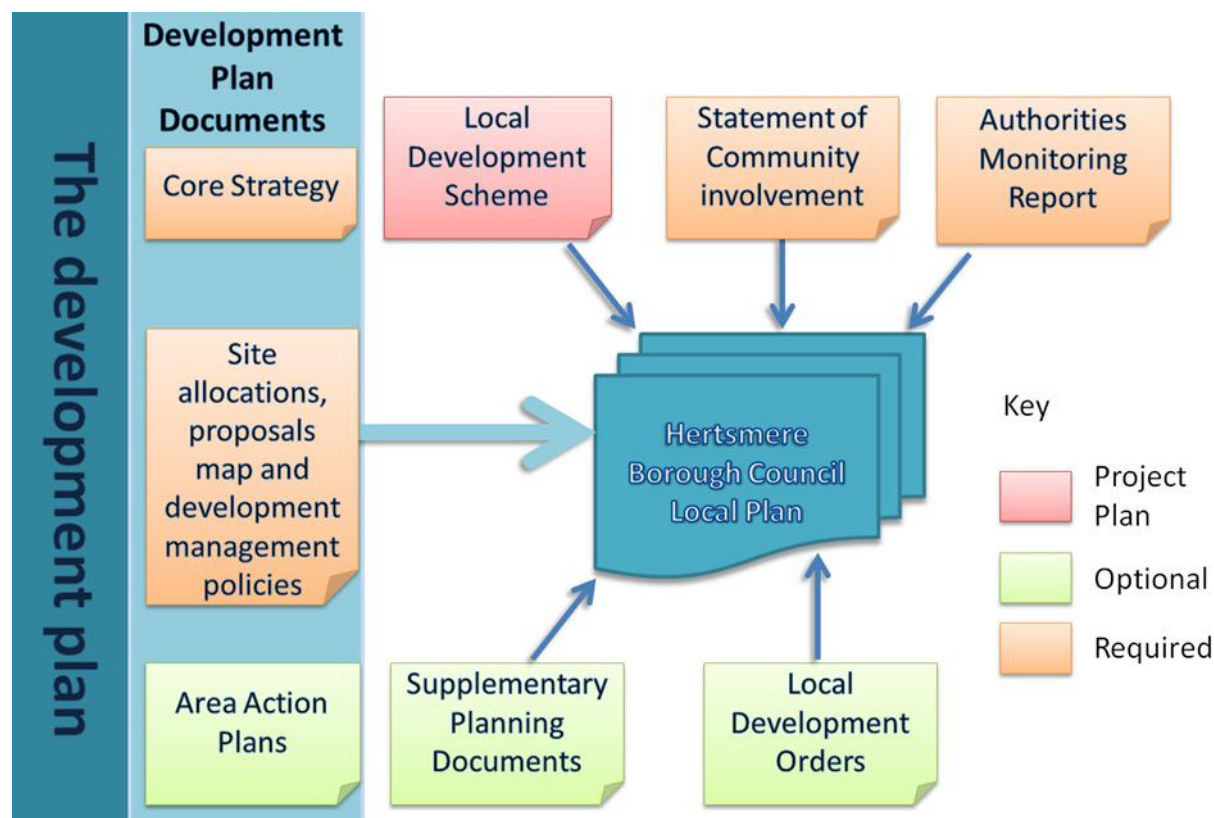
Figure 1: Hertsmere's Local Plan